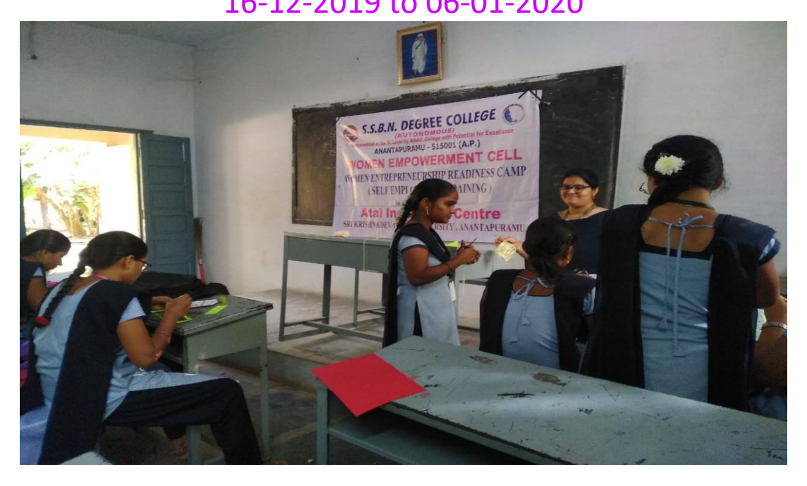
Students displaying Craft Designs

Self Employment Training Programme- Craft Designs for girl students 16-12-2019 to 06-01-2020