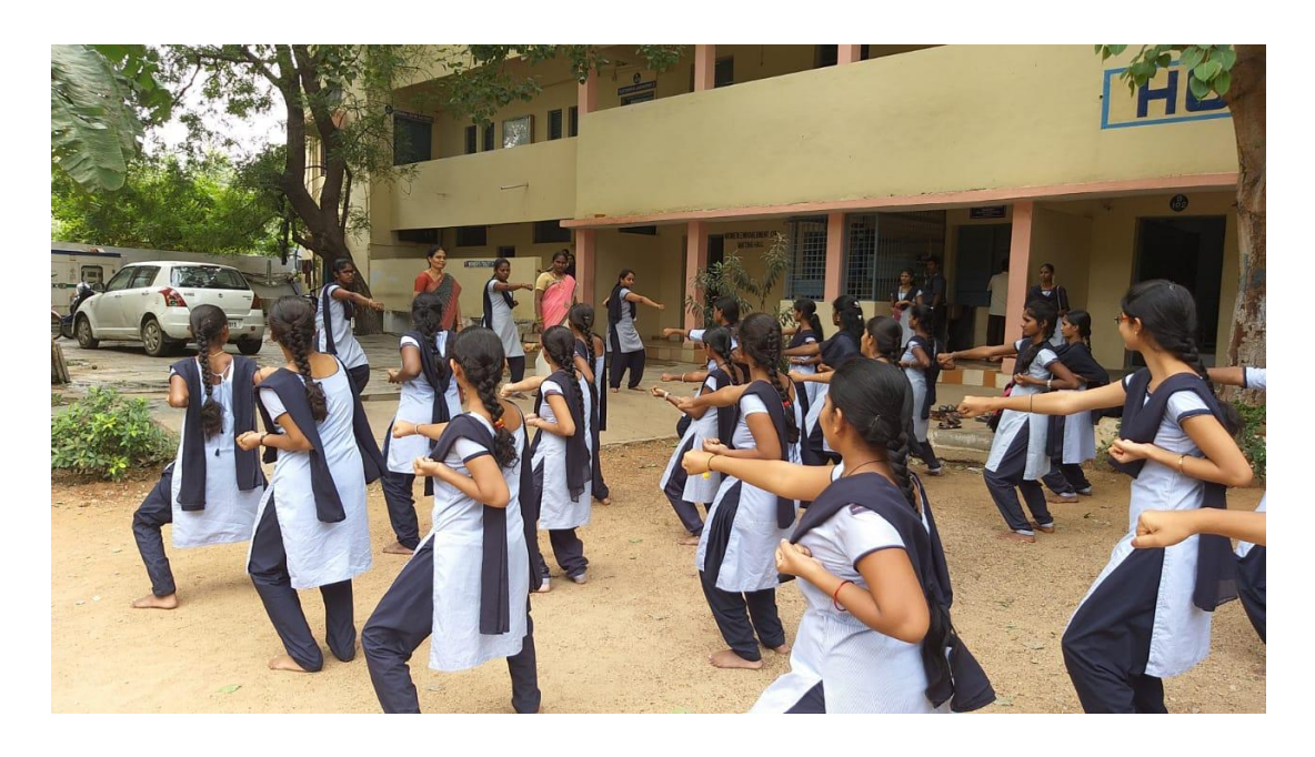
Students practicing Karate

Self Defense Programme Karate for girl students 22-07-2019 to 08-08-2019