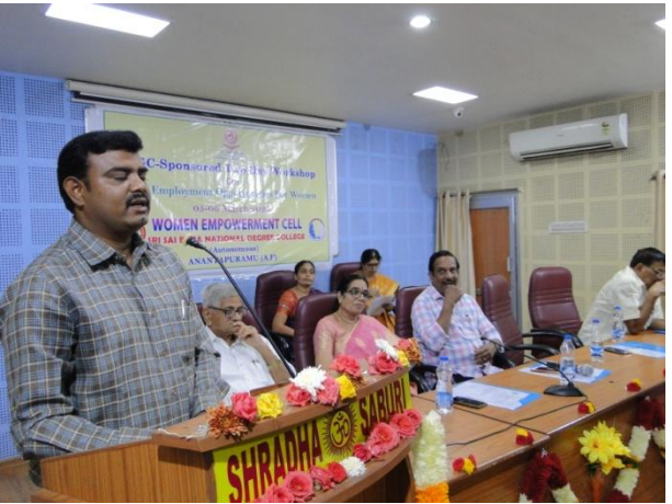
Secretary and Chief Guest addressing the audience