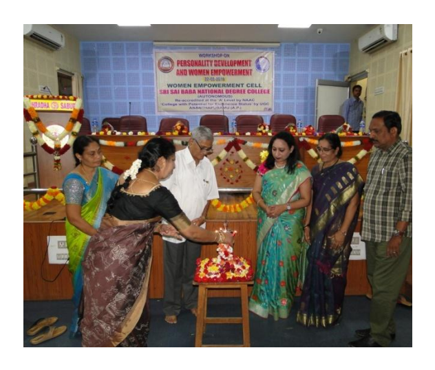
Lighting of the Lamp by the Dignitaries

Workshop on Personality Development and Women Empowerment 22-08-2019