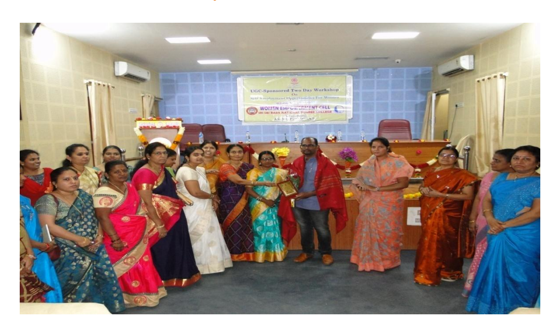
Honouring the Guest Workshop on Self Employment Opportunities For Women