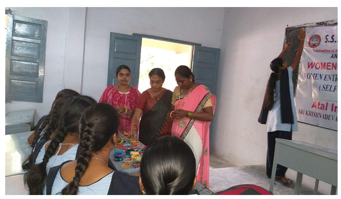
Students displaying Thread Bangles