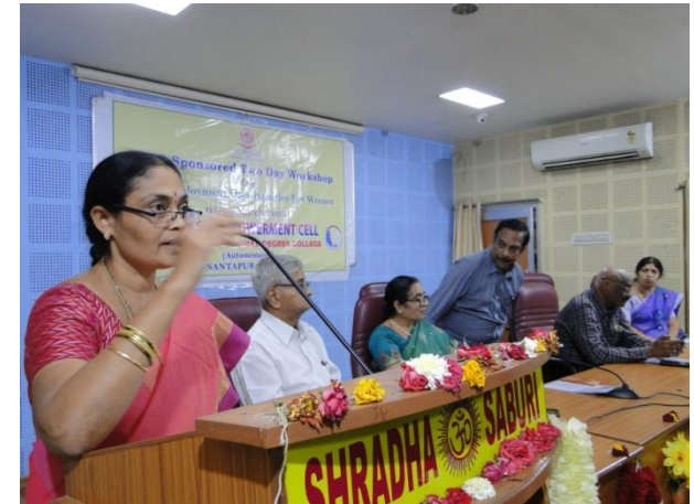
Principal and Convener addressing the audience