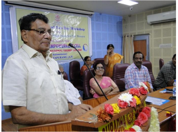
Correspondent and President addressing the audience

Workshop on Self Employment Opportunities For Women Inaugural Function-05-03-2020