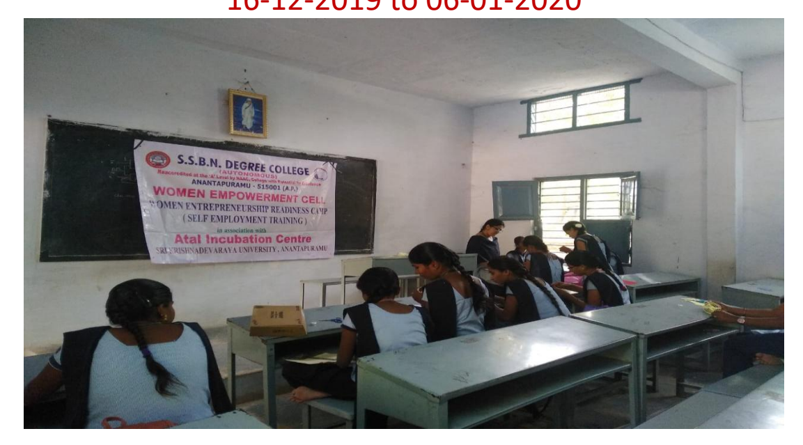
Students participating in Training Programme

Self Employment Training Programme- Craft Designs for girl students 16-12-2019 to 06-01-2020