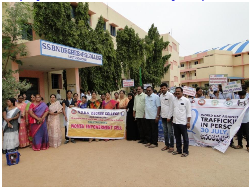
Students and staff participating in the Rally

World Day against Human Trafficking Rally - 30-07-2019