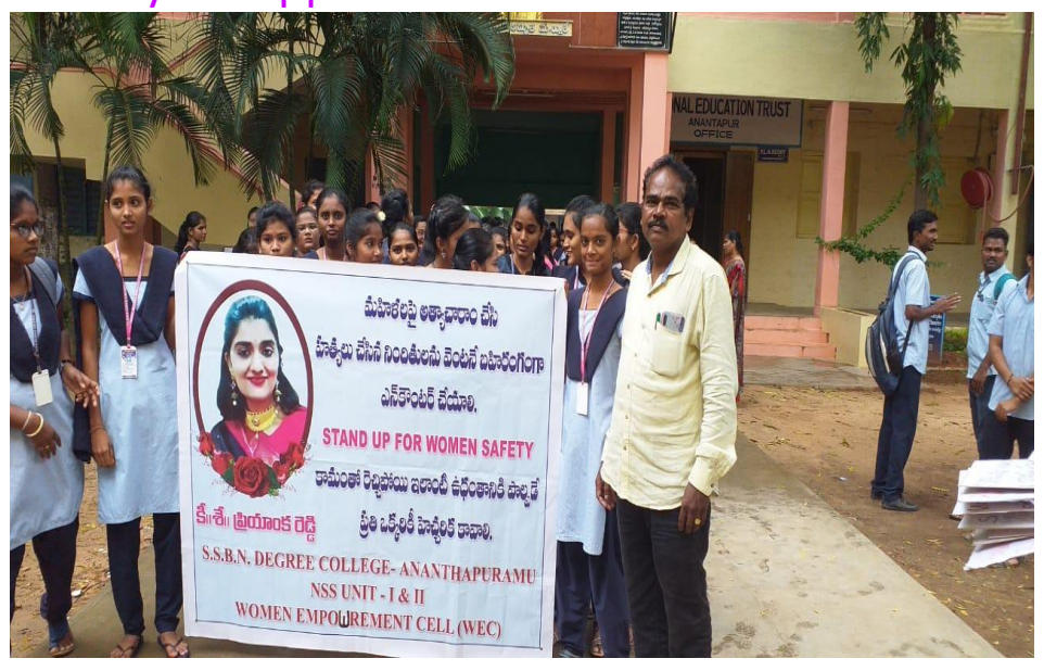
Students and staff participating in the rally

Rally in support of Disha case - 08-12-2019