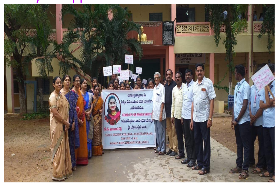
Correspondent, Principal, WEC members participating in the rally

Rally in support of Disha case - 08-12-2019