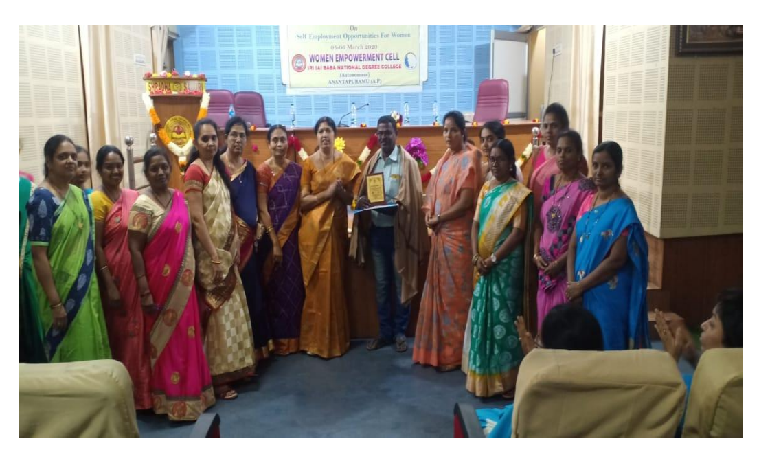
Honouring the Guest