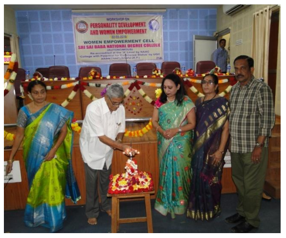
Lighting of the Lamp by the Dignitaries