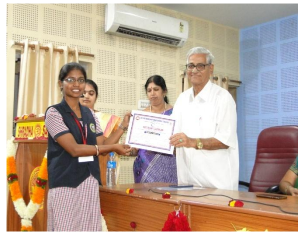
Distribution of Certificates