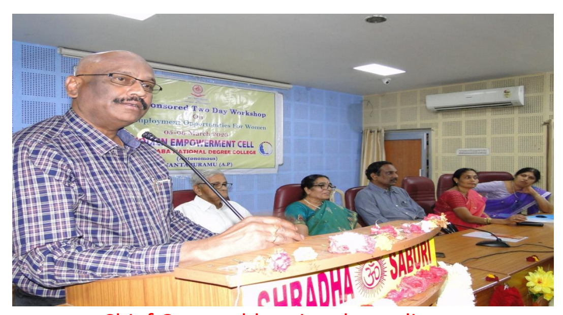
Chief Guest addressing the audience

Workshop on Self Employment Opportunities For Women Valedictory Function – 06-03-2020