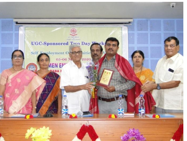
Honouring the Chief Guest Workshop on Self Employment Opportunities For Women

THERE IS NO TOOL FOR DEVELOPMENT MORE EFFECTIVE THAN THE EMPOWERMENT OF WOMEN - Kofi Annan