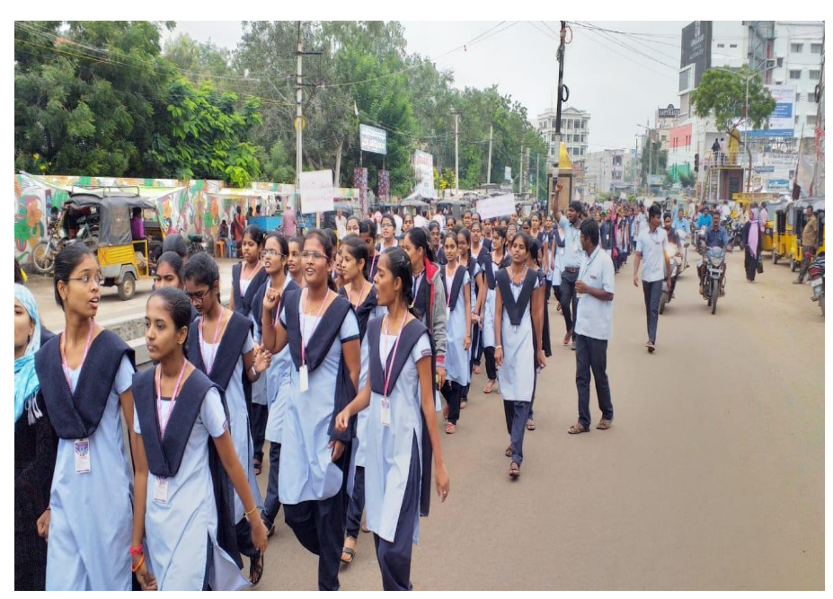
Students and staff participating in the rally