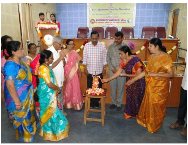
Lighting of the lamp